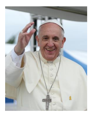
Pope Francis Pope, Roman Catholic Church